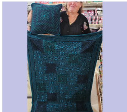
Terazzo Blanket & Cushion in Super 8 CHERYLC