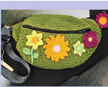
Adventurer's Cross Body Bag with Finch and flowers in catona DE'ARNE G