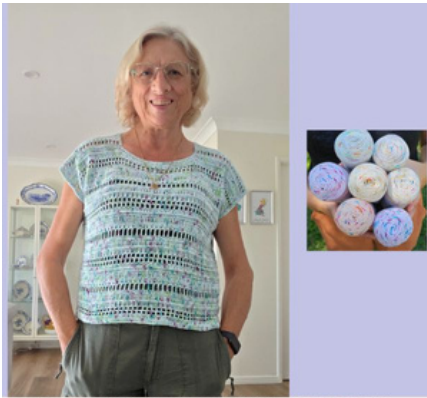
Coastal Shores Sweater, made in ocean Mist-fine VANESSA H

Send in photos of your makes to feature in December 2025 and you too could be in the running to win a voucher (see conditions on our website).