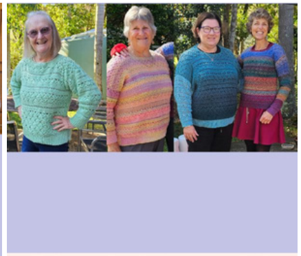
May Class made in various 4 ply yarns - superb 4, whirlette, wool LUSH SWEATER BY MERMAIDCAT DESIGNS