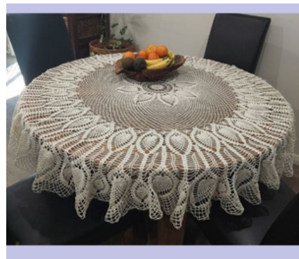
Table cloth made in Babylo BRENDA P