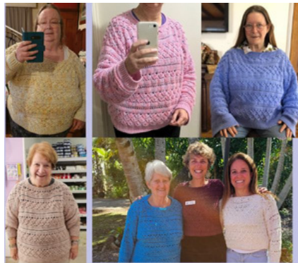
May Class made in various 4 ply yarns - posie, fusion, flora, superb 4 LUSH SWEATER BY MERMAIDCAT DESIGNS