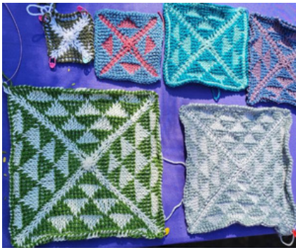
June Class TUNISIAN MOSAIC IN THE ROUND BY KNITTER KNOTTER