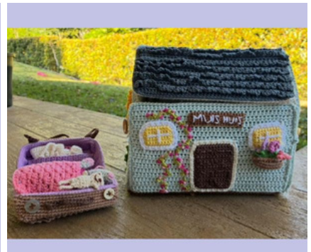
Etsy Pattern made in catona SONYA H