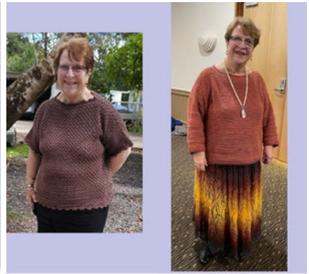
Crochet Tops in Catona FRAN D