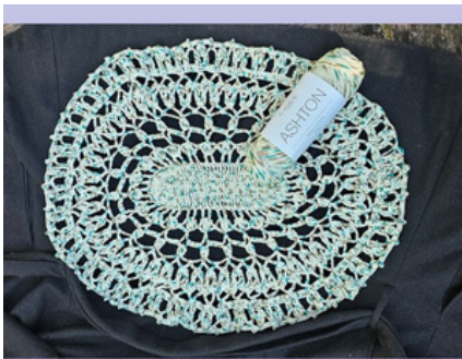
Dressing Table Set made with Ashton LYNDA T