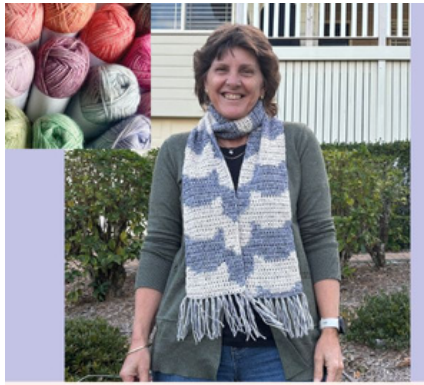
Scarf made with Marble cotton/acrylic LEE G