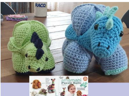
Dexter from Amamani Puzzle Balls made in Catona and Finch cottons