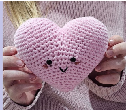
Happy Heart made in Finch cotton JEMIMA B