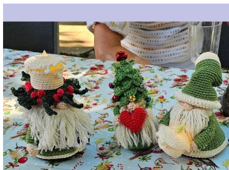
Christmas Gnomes made in Catona cotton