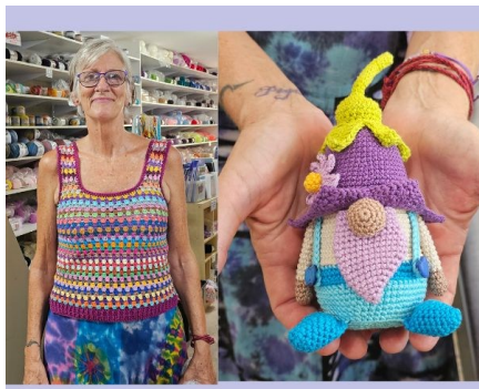
Purple has her own catona colour card with this beautiful top! And made this gnome in Catona too