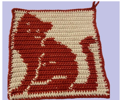
Cat Dishcloth in Tapestry crochet made in Finch cotton