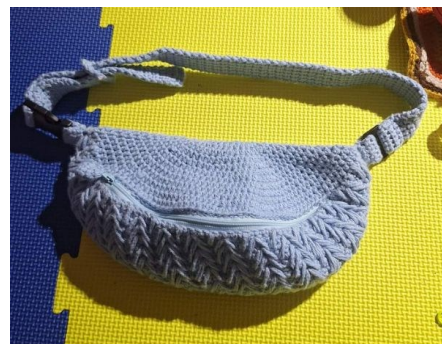
Cross Body Bag designed by Crochet with Lynda made in Finch cotton