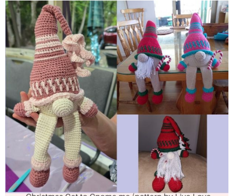
Christmas Get to Gnome me (pattern by Live Love Crochet Shaz) in Finch cotton DECEMBER CLASS