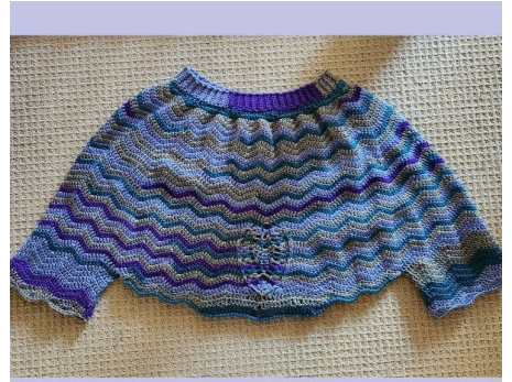
Ripple Swoncho designed by Fantastic Fabrications made in Superb 88