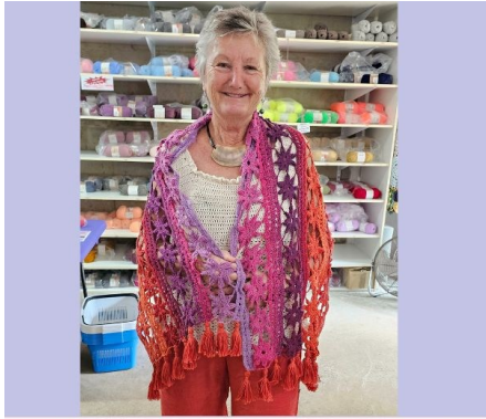
Kosmos Shawl made with a whirl and whirlette