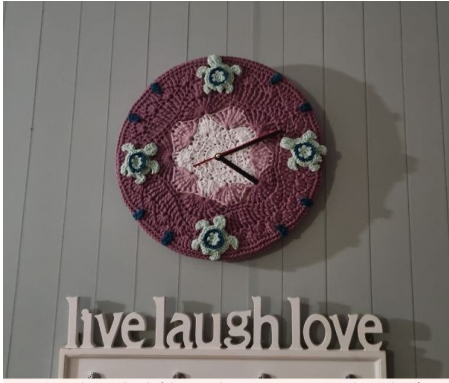
Catalina Clock (design by Live Love Crochet Shaz) made in Finch cotton