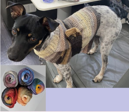
Dogs Coat from the book Dashing Doggy Dudds made with Fiddlesticks Superb Prints