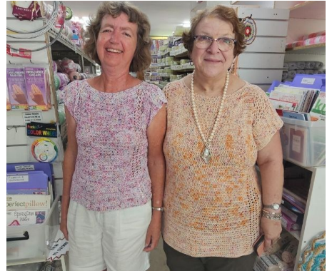
Tops made in Ocean Mist Fine cotton