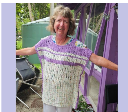
Opulance Pop-Over Top designed by Live Love Crochet Shaz made in Ocean Mist Fine cotton