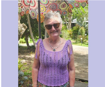
Tassel Tie Vest made in Posie Cotton