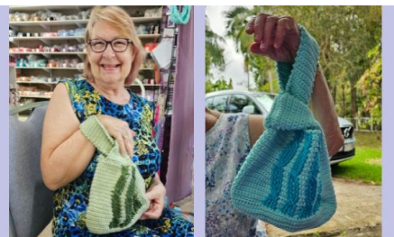
Meadering Vines Knot Bags designed by Crochet with Lynda made in Finch cotton SEPTEMBER CLASS