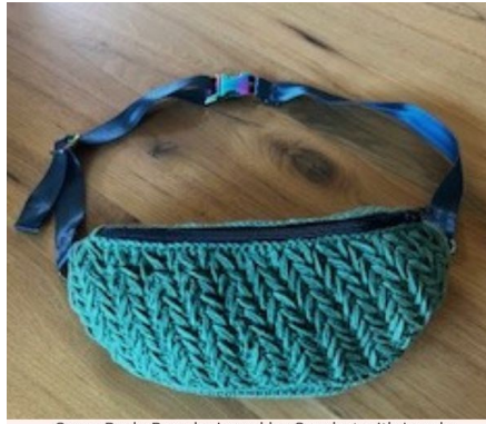
Cross Body Bag designed by Crochet with Lynda made in Finch cotton