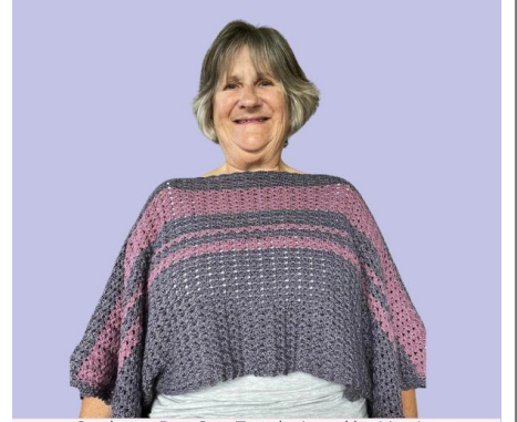
Opulance Pop-OverTop designed by Live Love Crochet Shaz made in Fusion