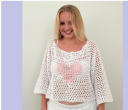
Mesh top made in Finch cotton JEMIMA B