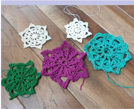
Snowflakes made in Catona and perle 5 PALMWOODS CLASS DECEMBER 2025