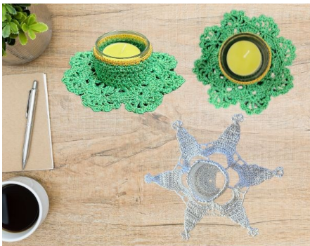
Candle holders made in Catona. (Star made in catona & metallic thread)