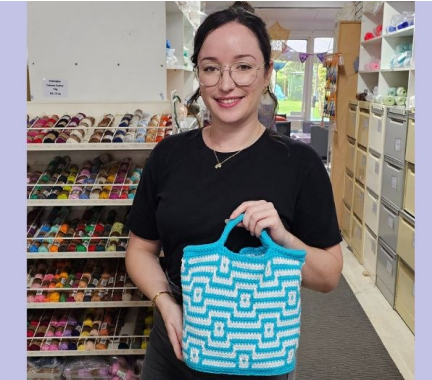
Mosaic bag in Finch cotton - design in Inside Crochet Magazine