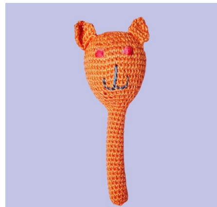
Baby rattle made in Catona cotton LYNDA T