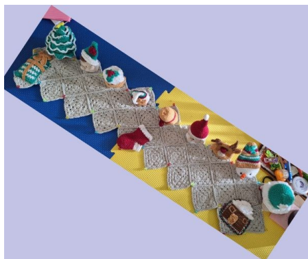
Christmas Crochet Fun made into a Table Runner & Decorations made in Catona

Thank you everyone for sending in pictures of what you have been making in the past quarter. We feature below some comments and masterpieces submitted by customers. Send us a photo of your masterpiece (via the submissions page, email or via our facebook page), telling us which book it came from and which yarn or thread you used, and be in the draw to win a $25 voucher in March 2025 (see conditions on our website). Please also add any tips you've picked up when making them. Congratulations to xxxxx for winning this quarter's voucher – submitting a photo of xxxxx