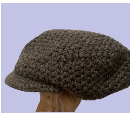
Golf Cap made in Fiddlesticks Superb 8