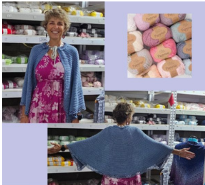
Vintage cape pattern in Papyrus cotton/silk SUE TIGELL