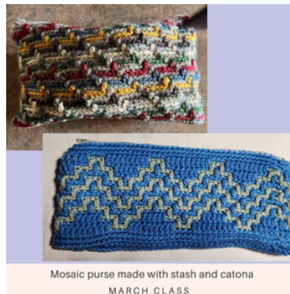
Mosaic purse made with stash and catona MARCH CLASS