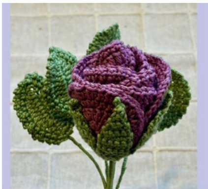
Pattern by loopara.com made with catona cotton ALISON K