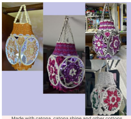
Made with catona, catona shine and other cottons a part of the 2026 LAL CRYSTAL BLOSSOM LANTERNS