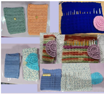
Made in various cottons - catona, superb 8, ashton, wren HOOK ROLL CLASS FEBRUARY 2026