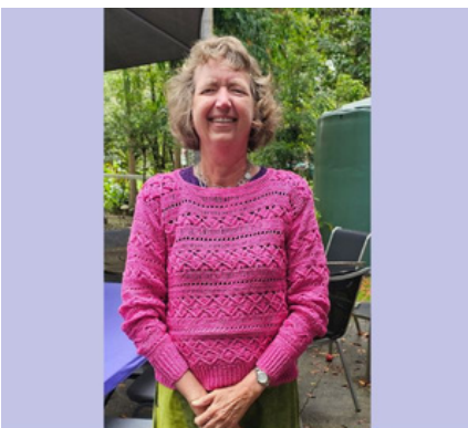
Lush sweater in almina 4 ply cotton FRANCIS D