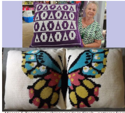
Mosaic & Tapestry cushions made in Finch - patterns from Simply Crochet Magazine SUE T