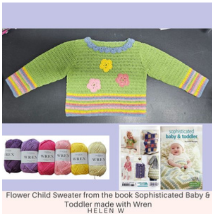
Flower Child Sweater from the book Sophisticated Baby & Toddler made with Wren HELEN W

Send in photos of your makes to feature in July 2026 and you too could be in the running to win a voucher (see conditions on our website).