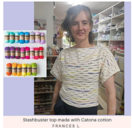
Stashbuster top made with Catona cotton FRANCES L