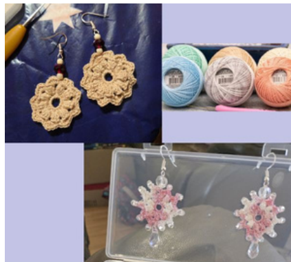
Earrings in Lizbeth Cotton #20 & #80 JEANETTE H