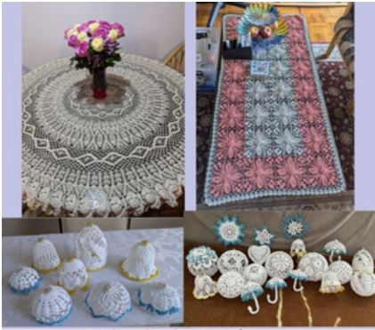
Maxi 10 thread and patterns from various magazines and books AGNES M