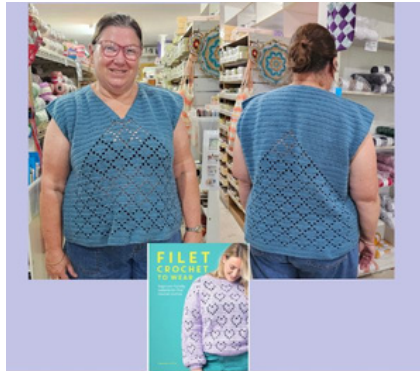
Dill Pickles Tee made with Fiddlesticks Super 8 from the book Filet Crochet to Wear ADRIANA C