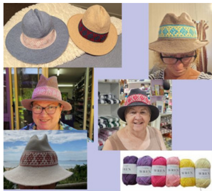
Cullen Fedora hats in Wren & Catona NOVEMBER CLASS