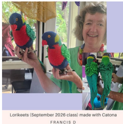
Lorikeets (September 2026 class) made with Catona FRANCIS D