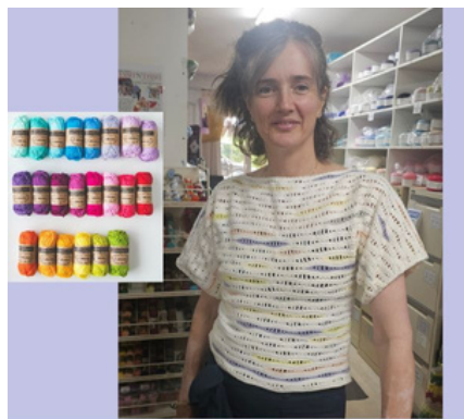
Stashbuster top made with Catona cotton FRANCES L