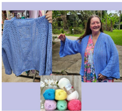
Hexigon Cardigan made with Superb 4 ELVIRA W