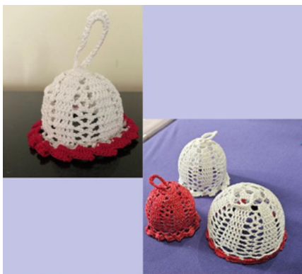
Lizbeth Cotton and mt perle 5 - Christmas Bells CHRISTMAS CLASS MAKES