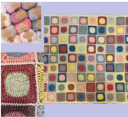
Baby's blanket using Papyrus cotton/silk ALISON K