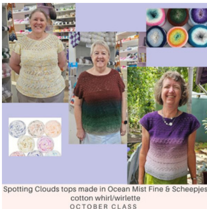
Spotting Clouds tops made in Ocean Mist Fine & Scheepjes cotton whirl/wirlette OCTOBER CLASS