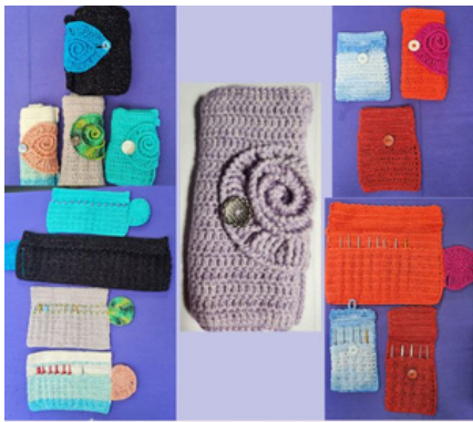
Made in various cottons - wren, marble catona chroma HOOK ROLL CLASS FEBRUARY 2026