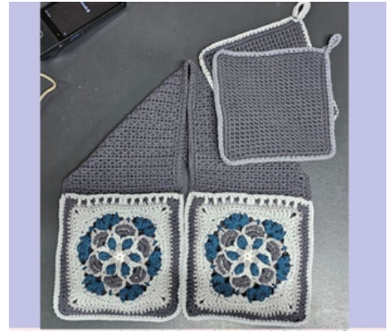
Oven Mitts and dishcloth made in Finch (adapted from Camelia Oven Mitts pattern) SUE T