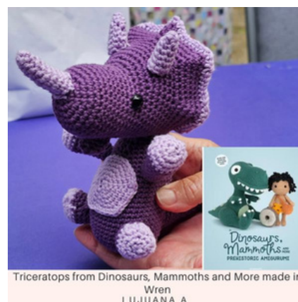
Triceratops from Dinosaurs, Mammoths and More made in Wren