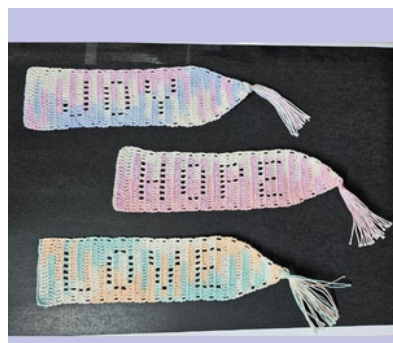
Book Marks made with Maxi #10 thread BETES R