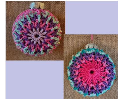
Christmas baubles made with Create Handmade cotton BETHEL D