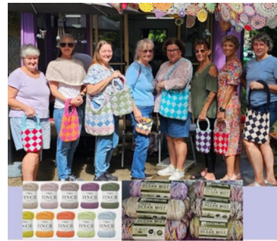
Argyle Allure Bags made with Fiddlesticks Finch, and Queensland Collection Ocean Mist APRIL CLASS