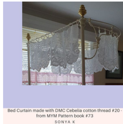
Bed Curtain made with DMC Cebelia cotton thread #20 - from MYM Pattern book #73 SONYA K