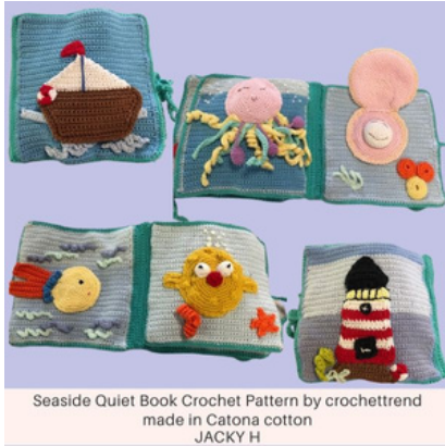
Seaside Quiet Book Crochet Pattern by crochettrend made in Catona cotton JACKY H