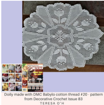
Doily made with DMC Babylo cotton thread #20 - pattern from Decorative Crochet Issue 83 TERESA O'H