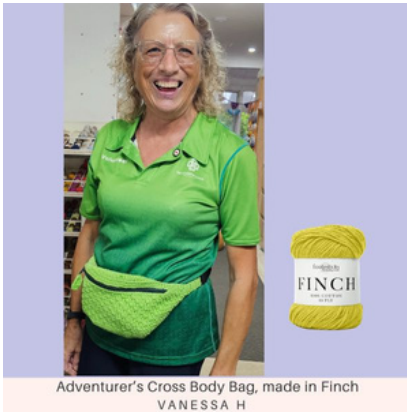
Adventurer's Cross Body Bag, made in Finch VANESSA H

Send in photos of your makes to feature in September 2025 and you too could be in the running to win a voucher (see conditions on our website).