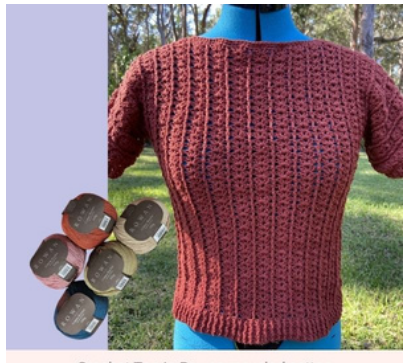
Crochet Top in Rowan recycled cotton CHRIS G