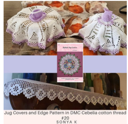
Jug Covers and Edge Pattern in DMC Cebelia cotton thread #20 SONYA K