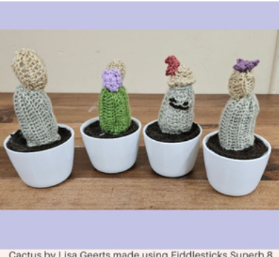
Cactus by Lisa Geerts made using Fiddlesticks Superb 8 Acrylic - each person put their own spin on the accessories KIDS LEARN TO CROCHET CLASS