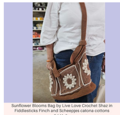
Sunflower Blooms Bag by Live Love Crochet Shaz in Fiddlesticks Finch and Scheepjes catona cottons PAM S