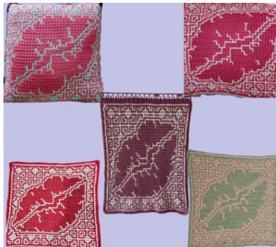
March classes - learning interlocking crochet with the Heart Lips square by Ashlee Brotzell Made using Finch or Rowan