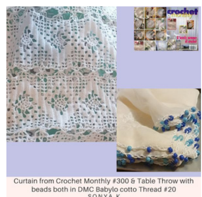
Curtain from Crochet Monthly #300 & Table Throw with beads both in DMC Babylo cotton Thread #20 SONYA K