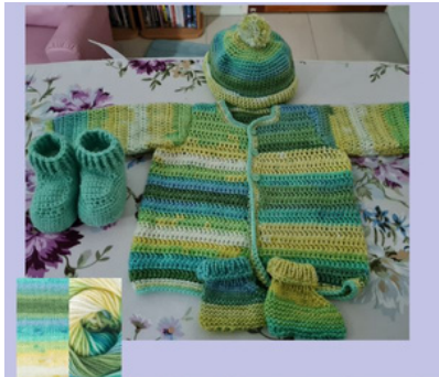
Baby Ugg Kit in Merino Soft and baby outfits done in Superb Prints KAREN W