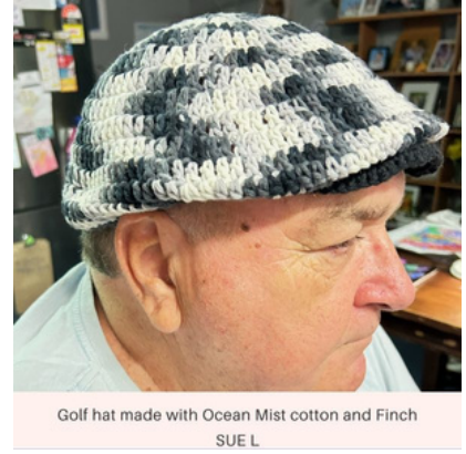
Golf hat made with Ocean Mist cotton and Finch SUE L