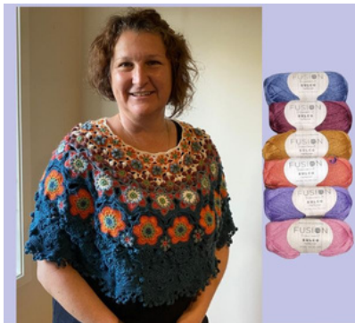
Capelet made with Fusion Sulco - baby llama and lycell ELODIE G