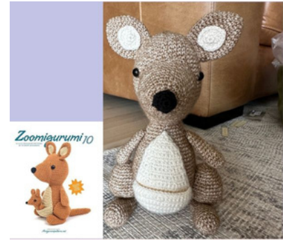
Kangaroo from the book Zoomigoorumi 10 using Scheepjes Stonewash GEORGIA C